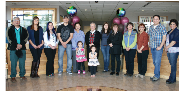
2013 graduation celebration

We celebrated 63 graduates in 2013, including high school, license, certificate, associate's, bachelor's and master's students! See our 2013 Graduate Yearbook at www.doyonfoundation.com .