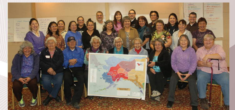
Where Are Your Keys language workshop participants