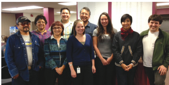
2013 scholarship award ceremony

For details on eligibility, deadlines, application process and scholarship types, please visit www.doyonfoundation.com or contact our scholarship program manager at 907.459.2049 or foundation@doyon.com .