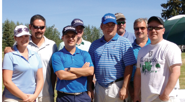
2013 Morris Thompson Memorial Golf Classic