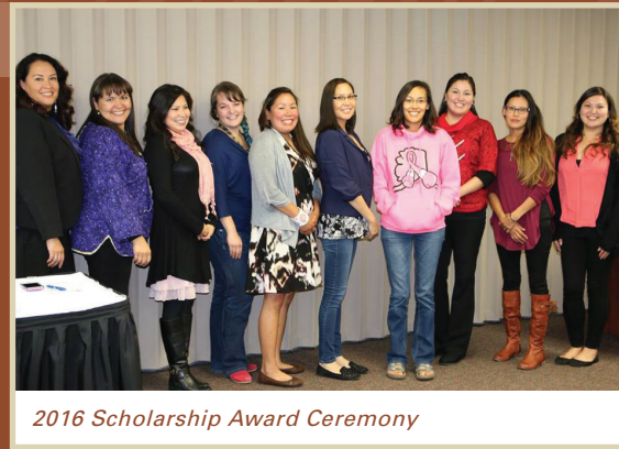
2016 Scholarship Award Ceremony