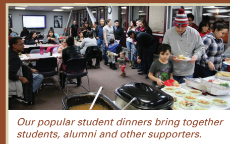
Our popular student dinners bring together students, alumni and other supporters.

Learn more and apply at doyonfoundation.com !